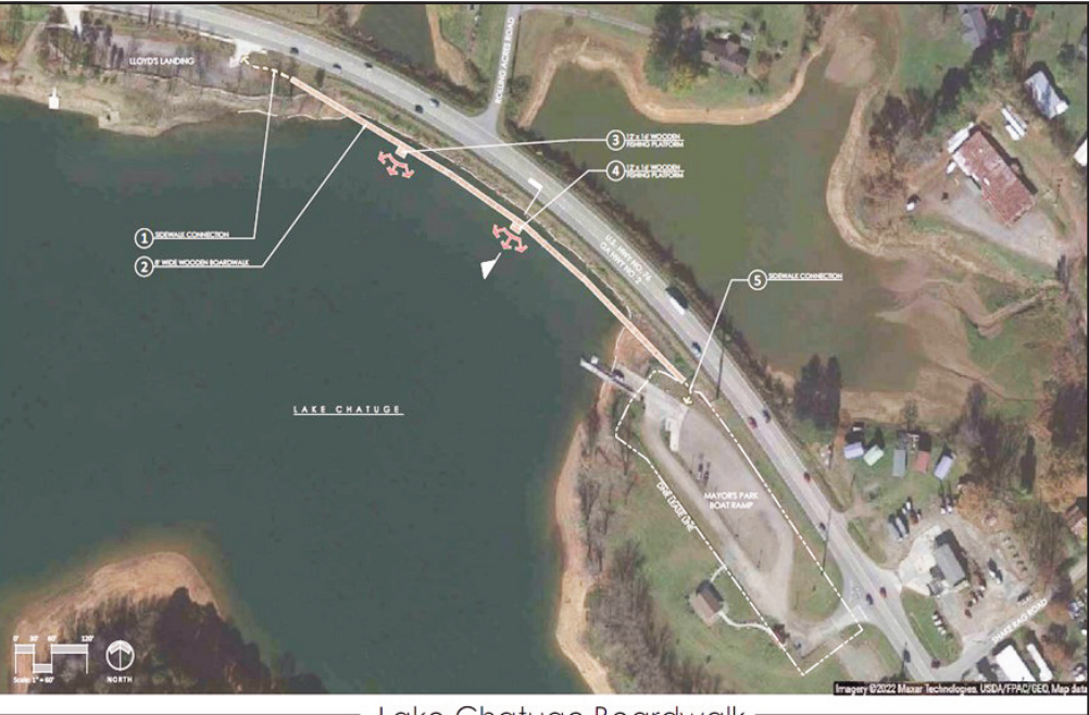
Lake Chatuge Boardwalk and Accessible Fishing Pier: Master Plan