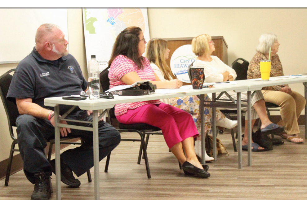
Members of the Hiawassee City Council during their most recent work session in City Hall.

By Brittany Holbrooks Towns County Herald Staff Writer