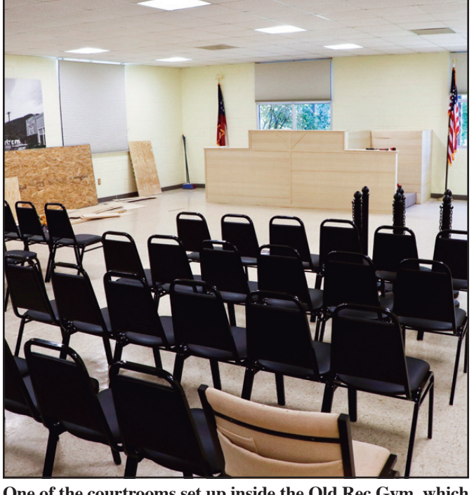
One of the courtrooms set up inside the Old Rec Gym, which will house the Temporary Courthouse & Administrative Offices during upcoming renovations of the courthouse build

"We have to order the vans when the state tells us to," she said, adding that after a certain amount of time, the state requires a replacement ve-