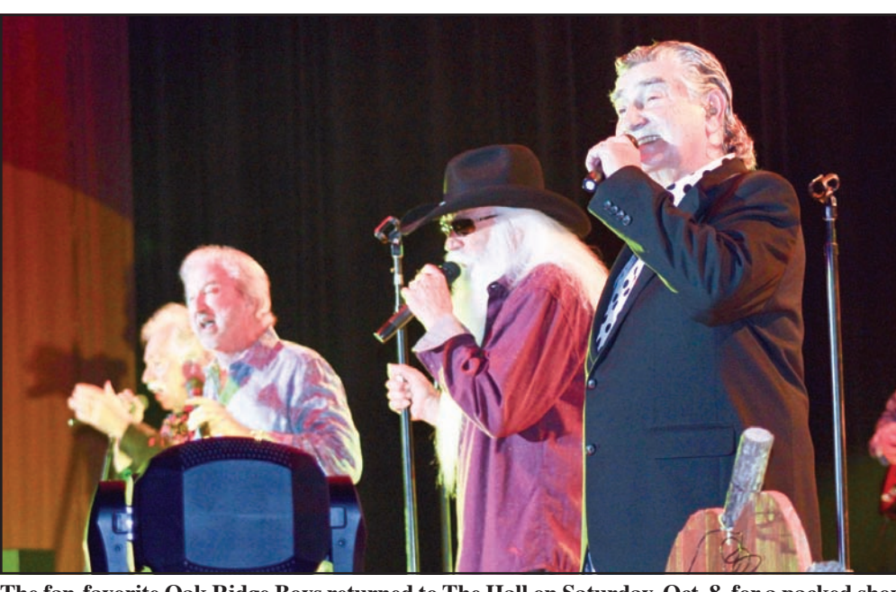
The fan-favorite Oak Ridge Boys returned to The Hall on Saturday, Oct. 8, for a packed show during the Georgia Mountain Fall Festival.

sion, which is $12 for a one-free. day pass, and children under 12 get in for free. Just as it has the Fall Festival for all it has to more, by the final day on Sat-