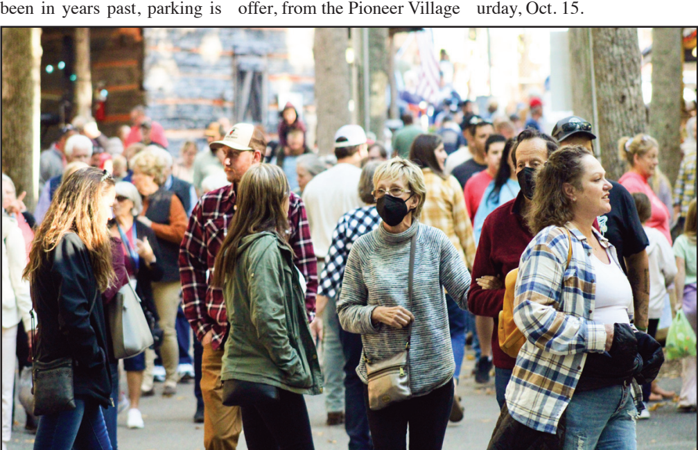
The Georgia Mountain Fairgrounds has been hosting throngs of visitors from far and wide for the Fall Festival, which will conclude this Saturday until its return in 2023.

to jewelry and clothing, home So, be sure to check out décor, sports memorabilia and